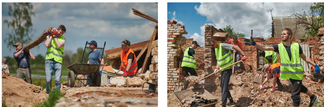
The removal of rubble in the village of Zagaltsy, Kyiv oblast