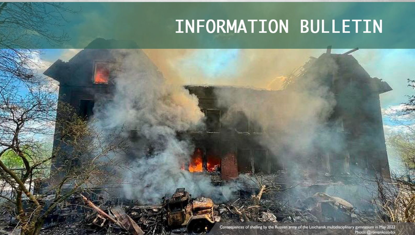
Consequences of shelling by the Russian army of the Lisichansk multidisciplinary gymnasium in May 2022

Propaganda and forced Russification in the occupied territories ..... 02